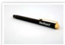
Stylus pen (included)